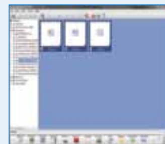
Presto!® PageManager® 9 SE