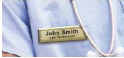
Label to look professional