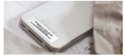
Label to protect your assets