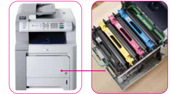
Front View of DCP-9040CN

The DCP-9040CN is designed for full frontal operation. This means that changing of consumables and loading of paper are all done through the front of the printer, giving you a greater level of convenience.