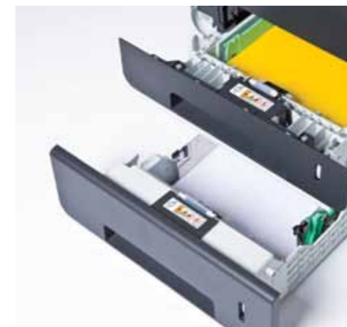
Optional second tray for more convenient paper handling