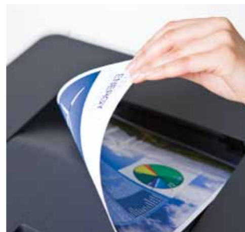
Double-sided printing reduces your paper consumption

With the HL-4150CDN's innovative, easy-to-use solutions, you can cut costs and save time on your office tasks.