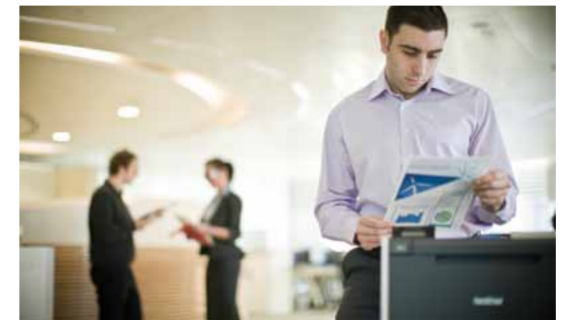
Ideal for busy offices: share resources via your existing network