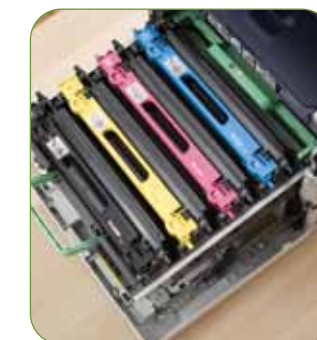
Toners & Drum