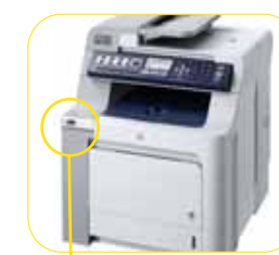
Connect and print documents directly from your USB media devices

The built-in USB interface lets you can send files* for printing from USB media devices like portable hard disks and flash thumb drives. Full PictBridge compatibility means you can also send photos from your digital camera to the printer for direct printing.