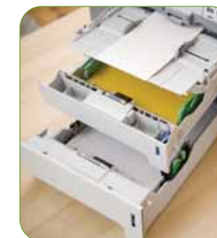
Paper Input Trays

The MFC-9440CN is designed for full frontal operation. This means that changing of consumables and loading of paper are all done through the front of the machine, giving you a greater level of convenience.