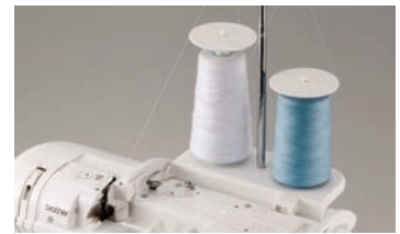
2-pin spool stand Detachable large 2-pin spool stand for large spool thread delivery or easy twin needle sewing.